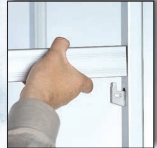
Tool free assembly