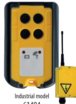
Industrial model 61494

* Compact model not compatible with our Autokit 80.