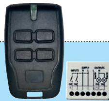
Compact model 61496

Mains-powered receiver, operating with a battery powered transmitter commands the opening control.