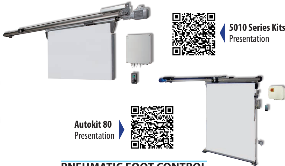
Autokit 80 Presentation